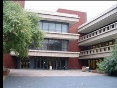
General Advising 12