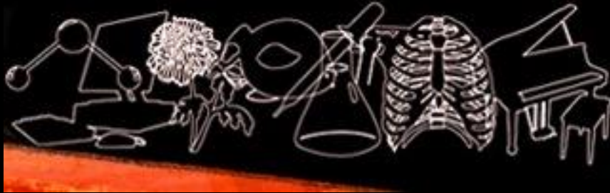
College of Arts and Sciences 2 (Biology)