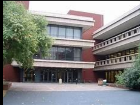
General Advising 12