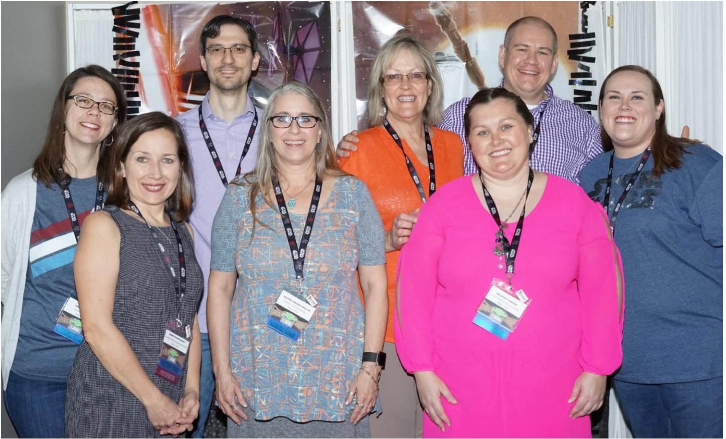
Executive Board Members at WIU's Drive-In!